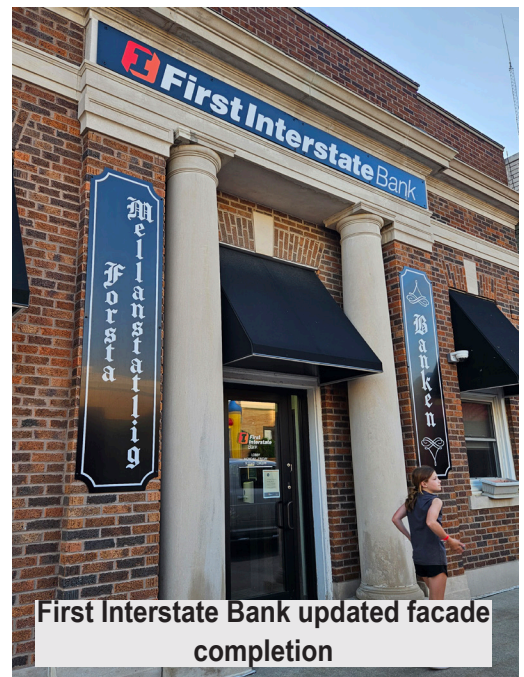
First Interstate Bank updated facade completion