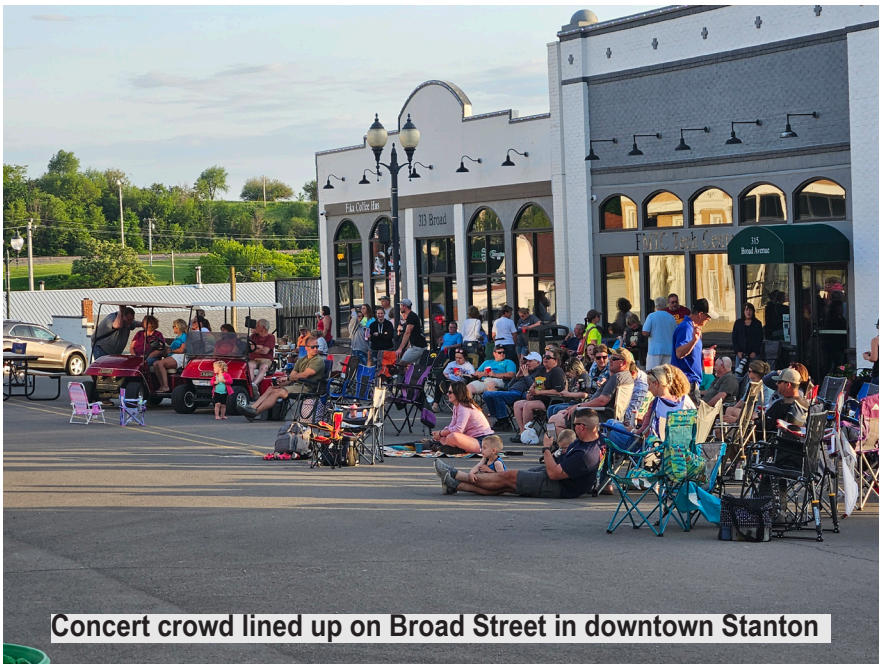
Concert crowd lined up on Broad Street in downtown Stanton